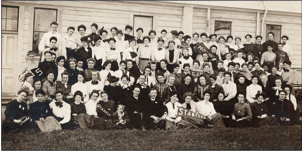
YWCA delegates pose in front of the Hotel Capitola, circa 1903.

the scene. The YWCA of Honolulu exhibits specimens of Hawaiian cloth and beautiful braided straw. There are also collections of bronzes, brasses and curios. The large cliff room of the hotel overlooking the bay is where the college scheme of decoration is carried out. The banners and posters from all the colleges of the Pacific slope have made it bewildering of color, but still very pretty. . . . 69