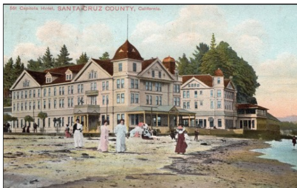
Postcard of Hotel Capitola. The hotel, built by F.A. Hihn in 1895, burned to the ground in 1929. (Capitola Historical Museum)

It would be impossible to find a more delightful place for the Pacific Coast conference than Hotel Capitola. The hotel is easy of access as it is about one hundred miles south of San Francisco; it is well adapted to conference use, and it is delightfully located directly on the coast. 11