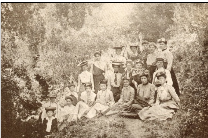
YWCA conference attendees enjoying the natural amenities of Capitola, circa 1903.

Another attendee felt that the “. . . frolics are by no means the least important part of the