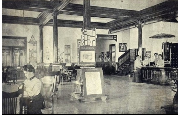
View of the Hotel Capitola lobby, c. 1903.

At fifteen minutes after eight in the morning came the missionary meeting, then the Bible classes and there were two of these. After that the student and