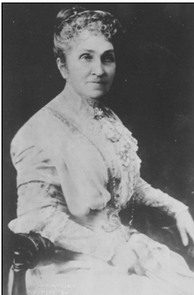
Phoebe Hearst, c. 1915

The first Capitola conference in 1900 drew 115 delegates from 23 colleges and normal (teachers’) schools, with five Western states represented (California, Nevada, Idaho, Washington, and Oregon). 22 The 1904 conference program noted that California delegates were “. . . granted the fare and a third rate for the round trip” and students from elsewhere would be provided financial assistance. 23 Delegates were advised to pack “walking skirts, tennis racquets, kodaks, bicycles, etc.” and assured that “. . . suits for surf bathing are furnished without extra expense.” 24 At Capitola the ladies were charged a $5.00 program fee and board at the hotel cost them $1.00 per day. 25