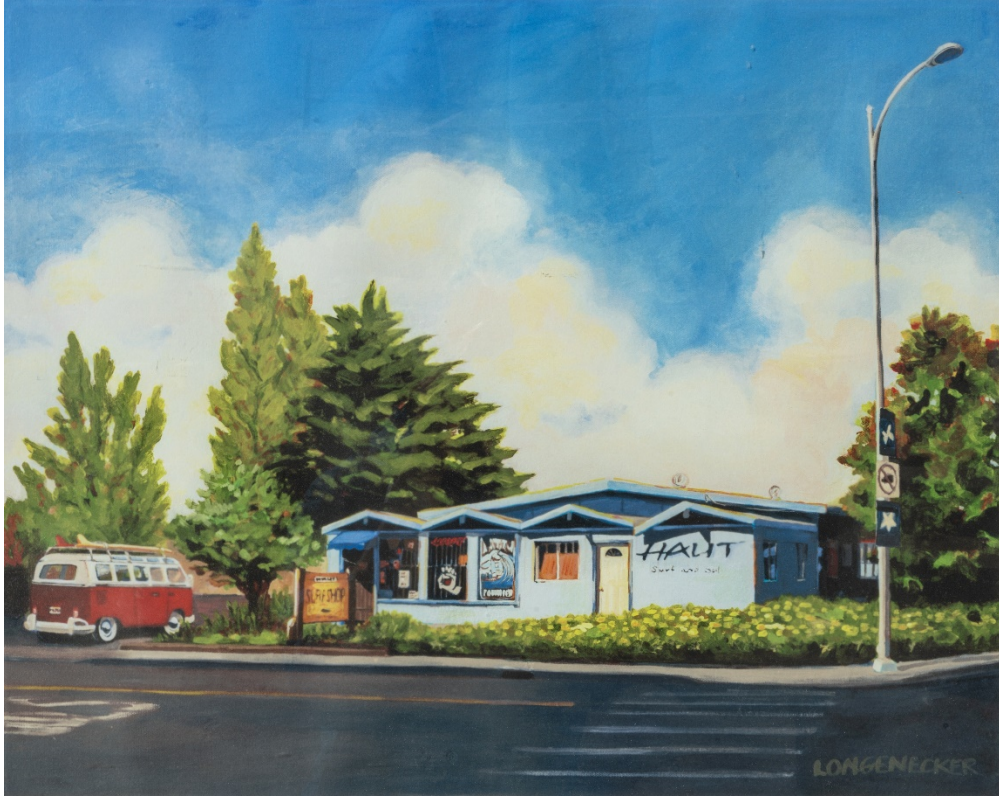
Painting of the Haut Surf Shop on Swift St. in 1969 with shaping and retail in same location.