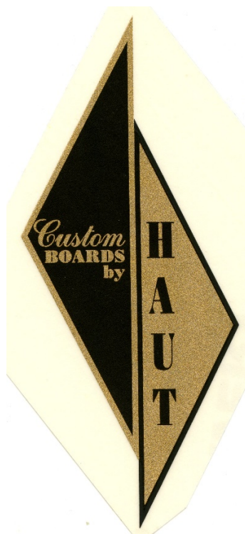
Haut Custom Surfboards Sticker