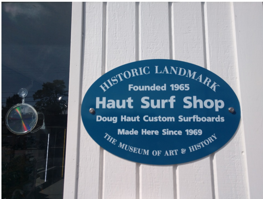
Close up view of the Blue Plaque on Swift St. shop.