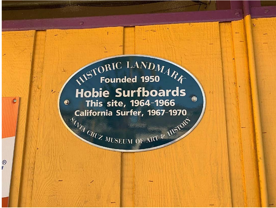
Hobie Surf Shop Blue Plaque