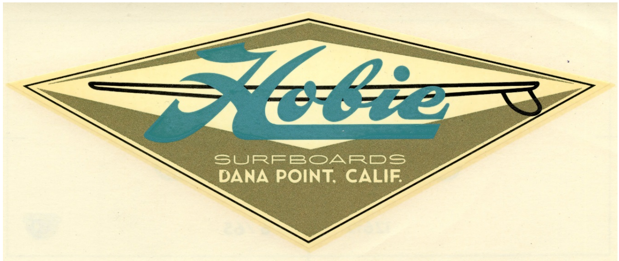
Hobie Surfboards Sticker