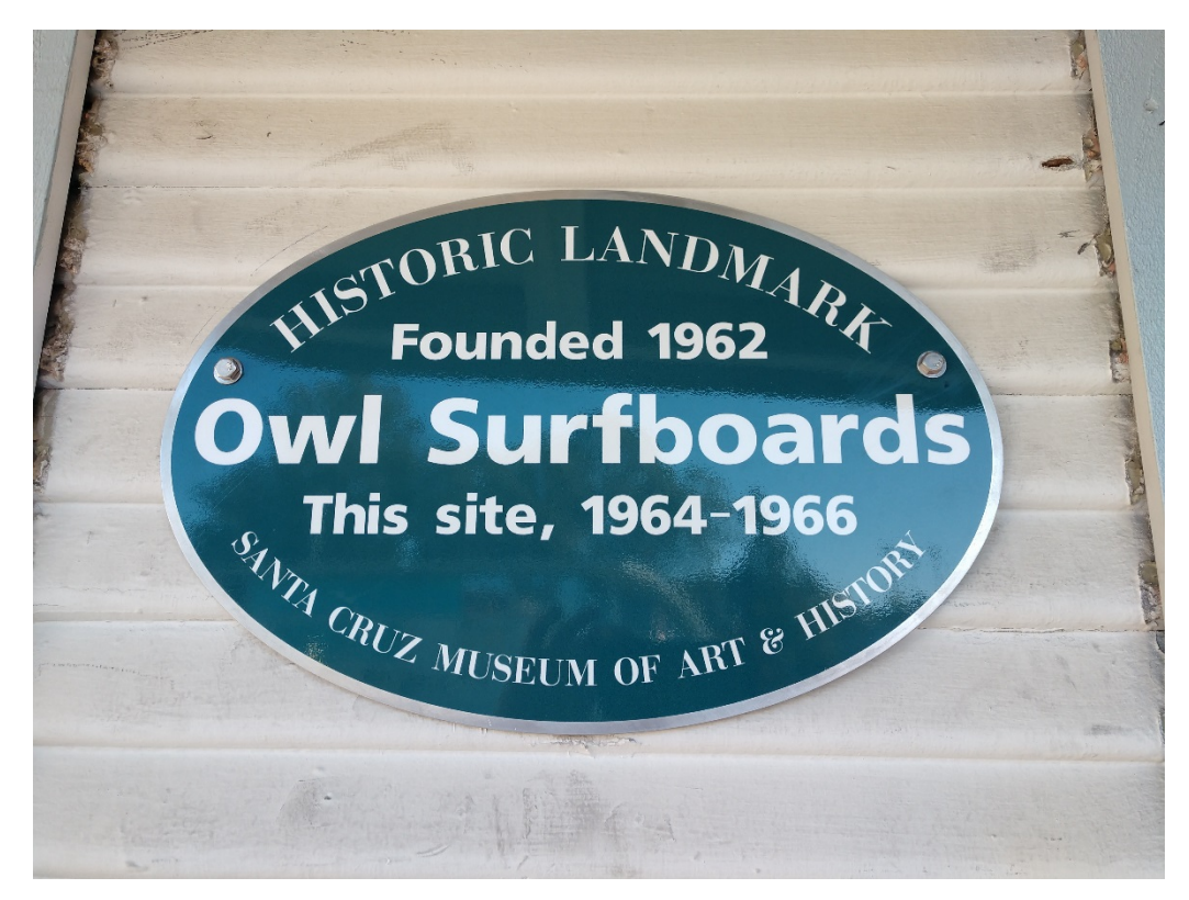
Owl Surf Shop Blue Plaque