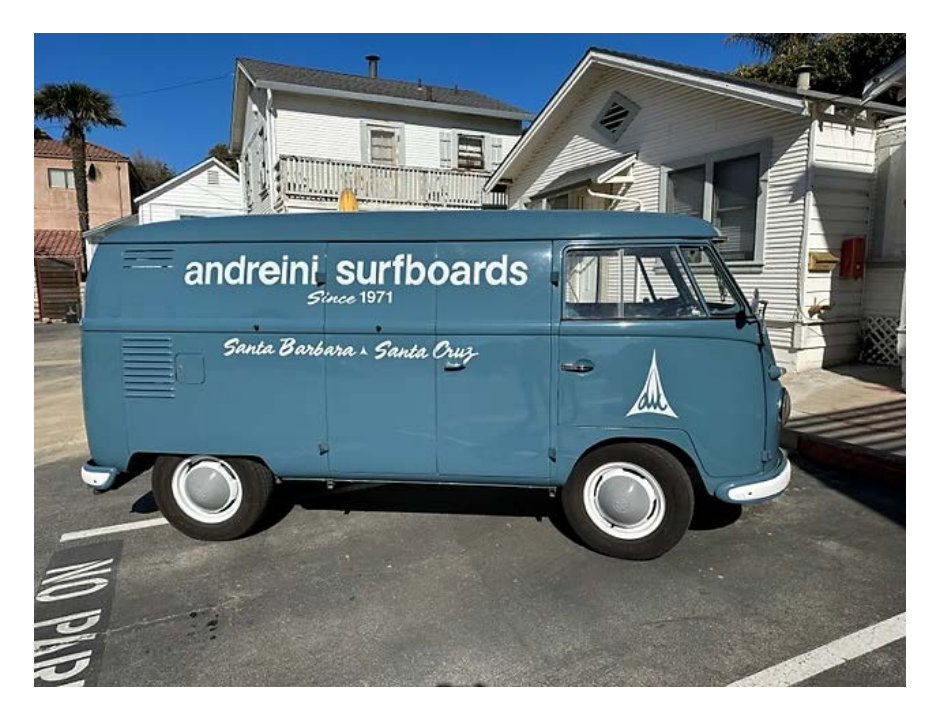
Marc Andreini Surfboards 1958 VW Panel Van.