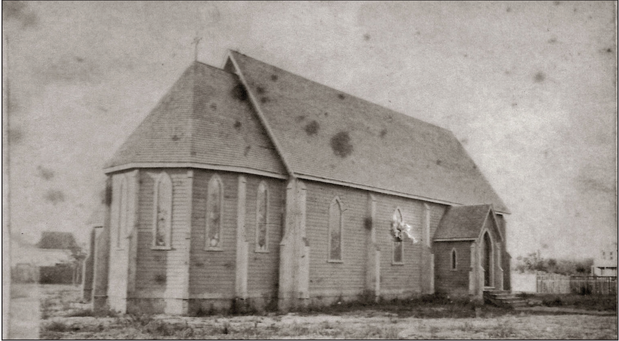
The Calvary Episcopal Church in 1864. This is the simple white church built by the Bostons; it is now the sanctuary of today's "little red church" in downtown Santa Cruz.